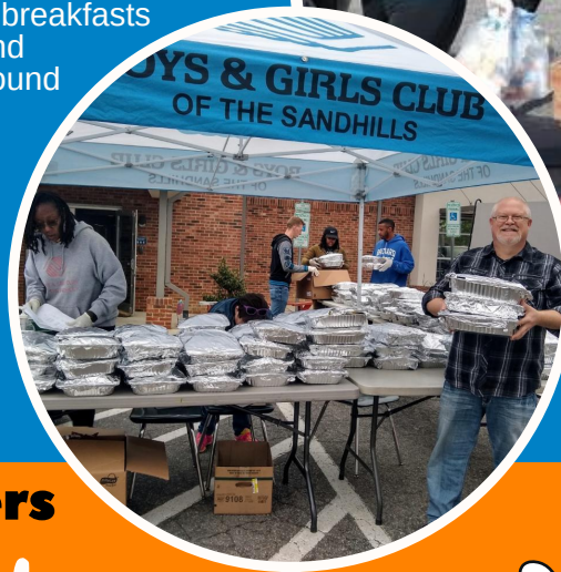
Volunteers and BGC staff distribute free meals from the Boys & Girls Club to help prevent hunger during the crisis.